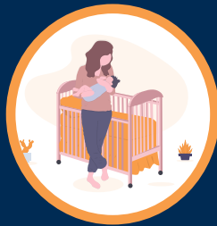
Public assistance like SNAP & WIC