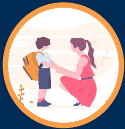
Head Start & early education