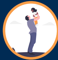
Foster care & adoption assistance