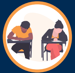
Pell Grants for higher education